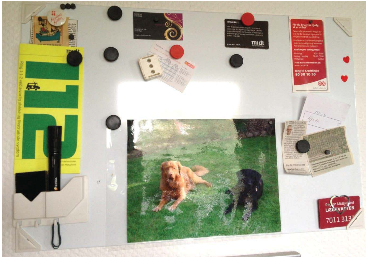
A notice board in one of my informants' kitchen displaying various health informations together with mailing price list, a hairdresser's business card, measurements for a new cushion, and some beloved dogs.

normative ideas of healthy lifestyle and a harmonious emotional atmosphere which in the Danish middle class context often will be described as hyggelig .